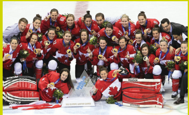
At the Winter Olympic Games in Sochi, Canadian Women beat the USA 3-2 in overtime in the women's hockey final at the Bolshoy arena.