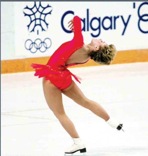
Canada's Elizabeth Manley participates in the figure skating event at the 1988 Winter Olympics in Calgary.

I don't follow sports. I don't even pretend to like hockey. But when the Winter Olympics start I marvel and hold my breath with the rest of the world as our athletes soar or stumble. Since the Winter Olympics in Calgary in 1988, with its Battle of the Brians and Elizabeth Manley's surprise silver, the art and athleticism of figure skating has made it my favourite Olympic sport. Figure skating is grit and grace; our skaters are power and promise. Ice dancing in particular is a paradox, much like legal advocacy: clear rules in a strict arena judged by experts, created so we can challenge boundaries through art and creativity. Lawyers don't get gold medals. But it still feels great to win.